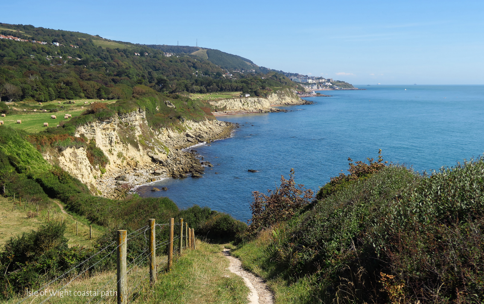
Isle of Wight coastal path