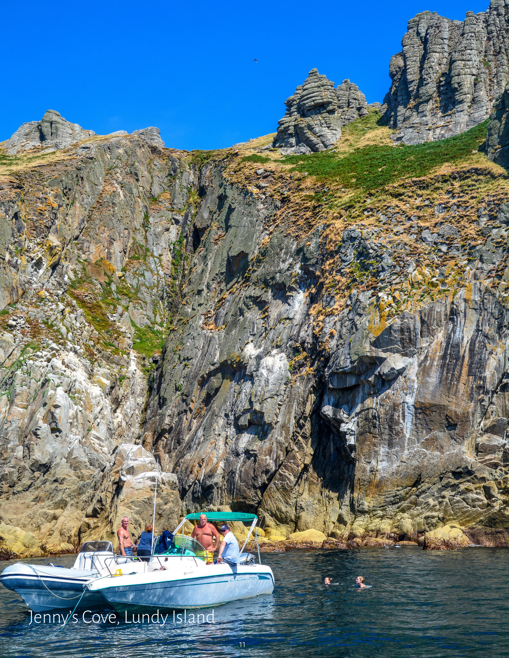
Jenny's Cove, Lundy Island