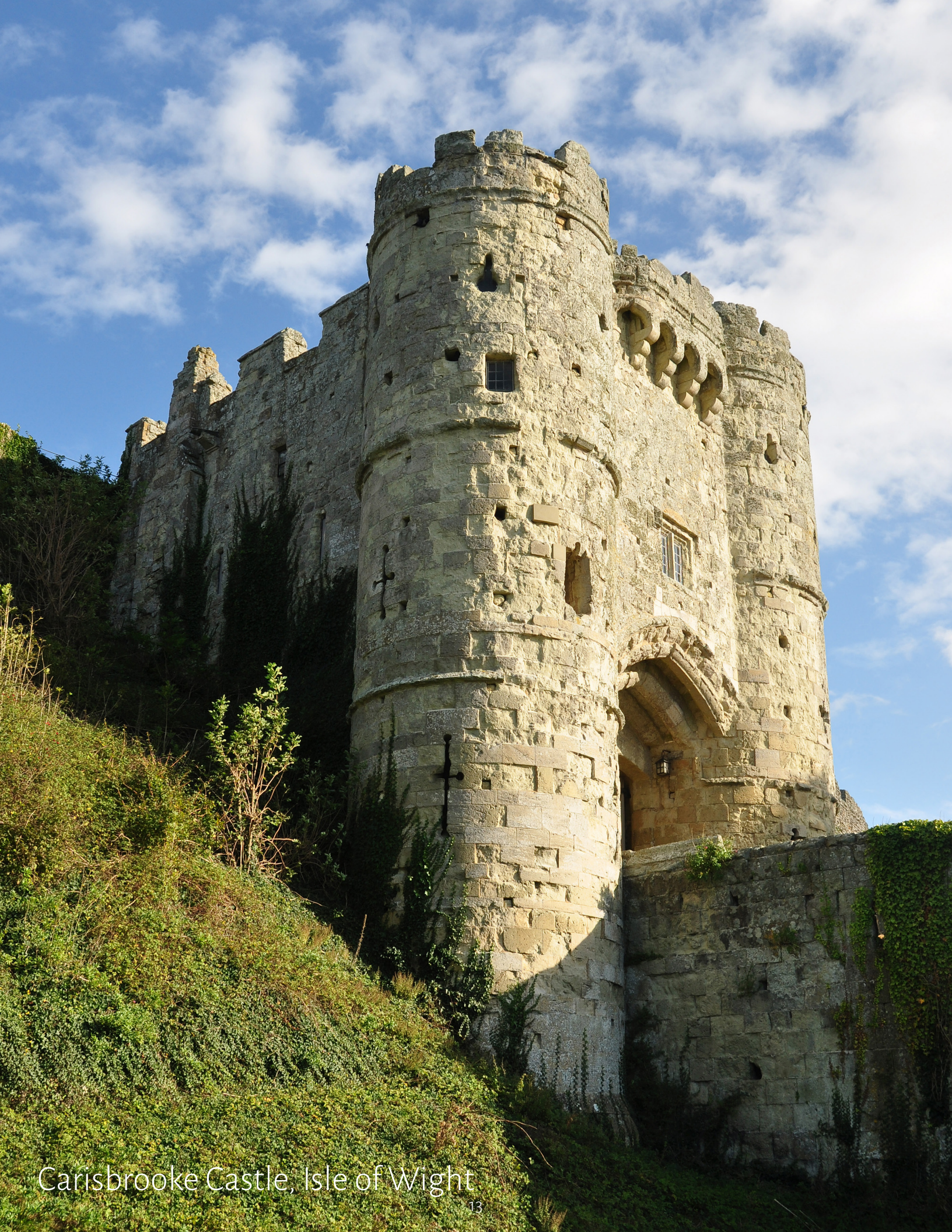
Carisbrooke Castle, Isle of Wight