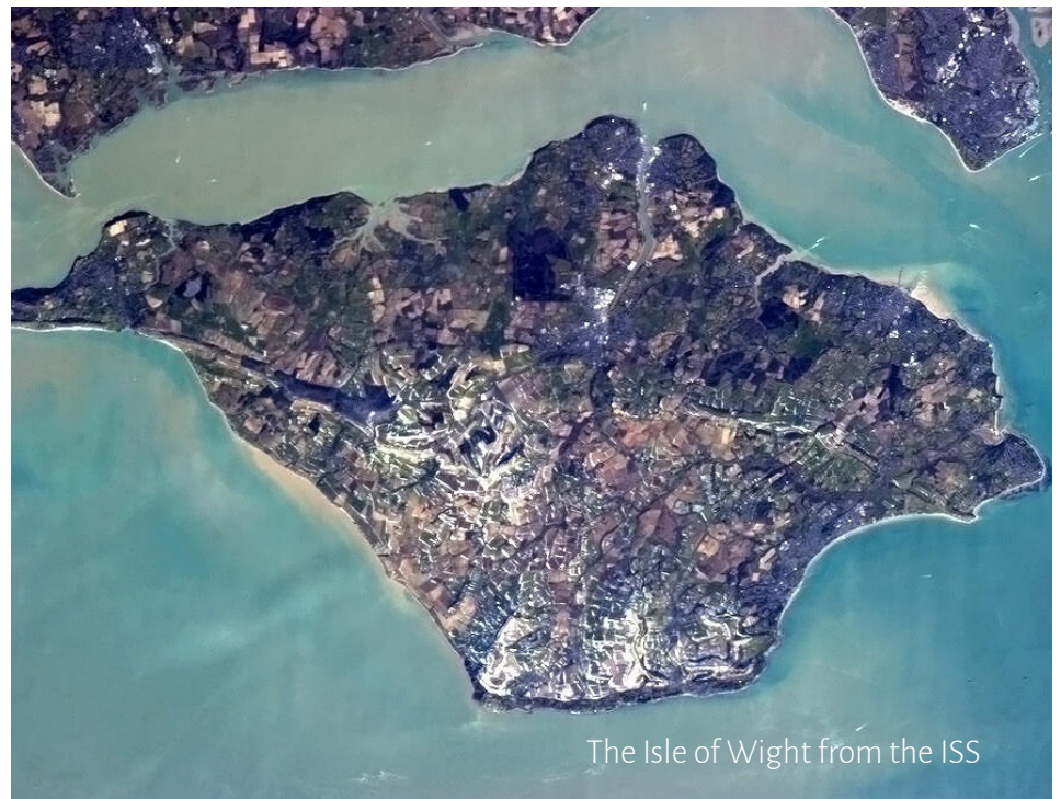
The Isle of Wight from the ISS