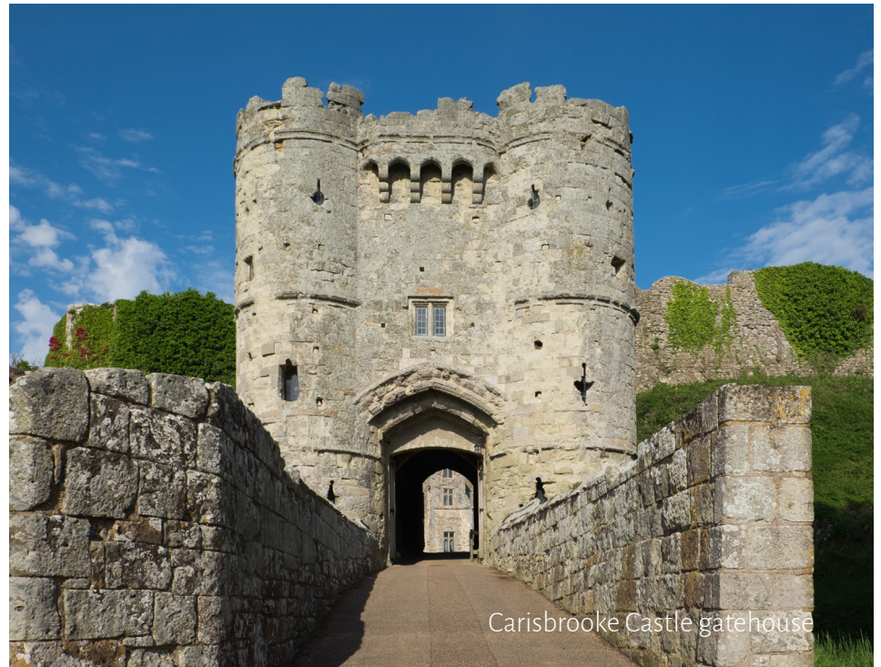
Carisbrooke Castle gatehouse

Inland you'll find the picturesque village of Godshill, famed for its quaint thatched cottages, historic church, and traditional tea rooms serving delicious cream teas. Take a stroll through the village, admiring the floral displays and browsing the local craft shops for unique souvenirs.