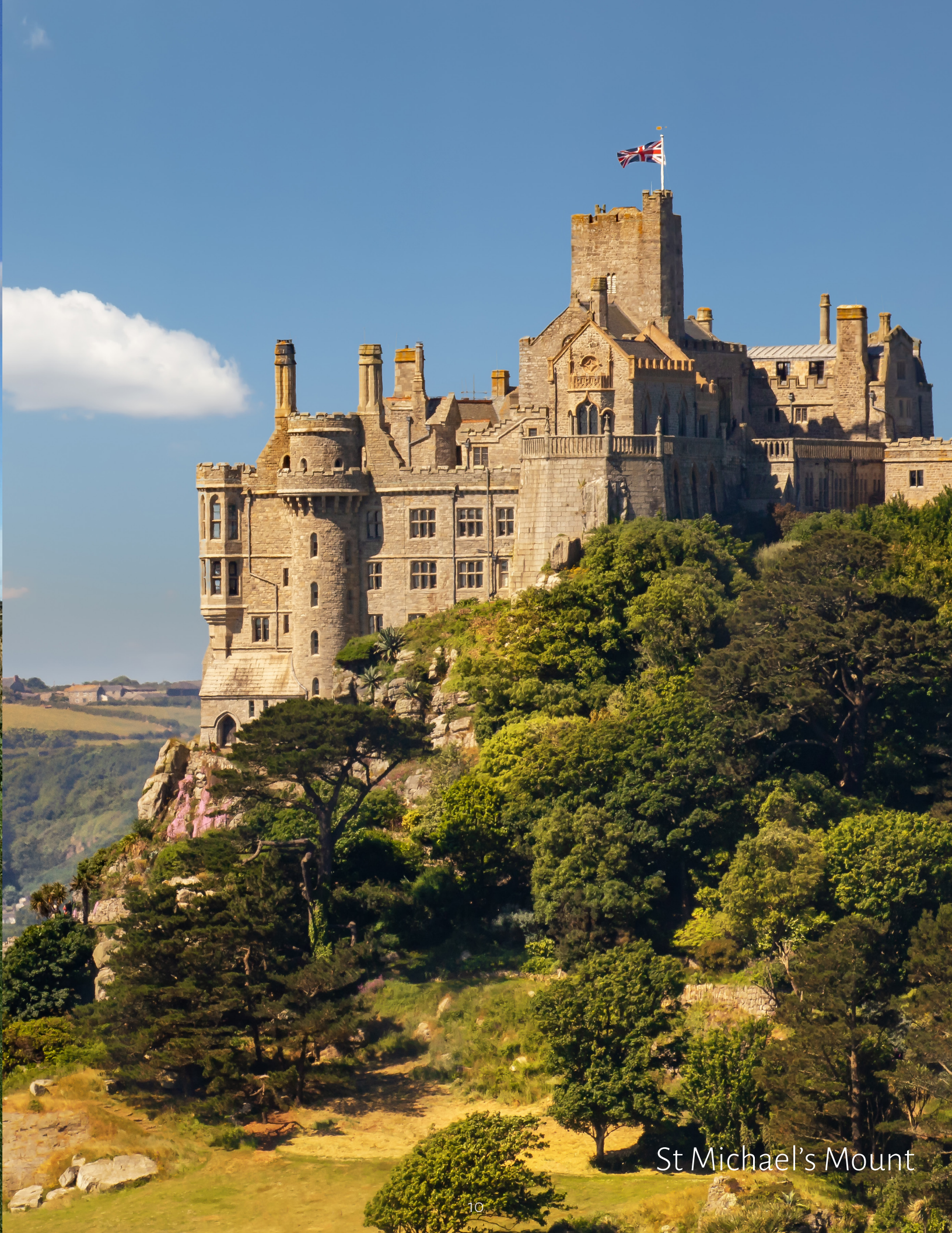
St Michael's Mount