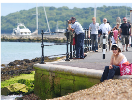
Enjoying the view from the esplanade

Viewed from the air, the Isle of Wight looks like a chunk of England's south coast has broken away from the mainland. Spanning just 23 miles from east to west, this compact island packs a punch when it comes to natural beauty and cultural attractions, with its stunning coastline, picturesque villages, and rich history. Whether you're seeking outdoor adventures, historical landmarks, or a relaxing rural escape, the Isle of Wight is well worth adding you your itinerary.