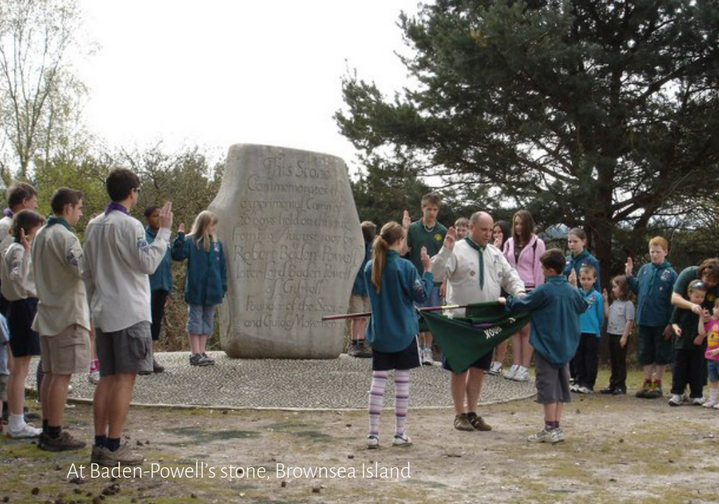
At Baden-Powell's stone, Brownsea Island

observed the transformative power of outdoor experiences in character development and leadership skills in young people. Inspired by the success of the camp, he published 'Scouting for Boys' in 1908, outlining the principles of scouting and laying the foundation for a global youth movement.