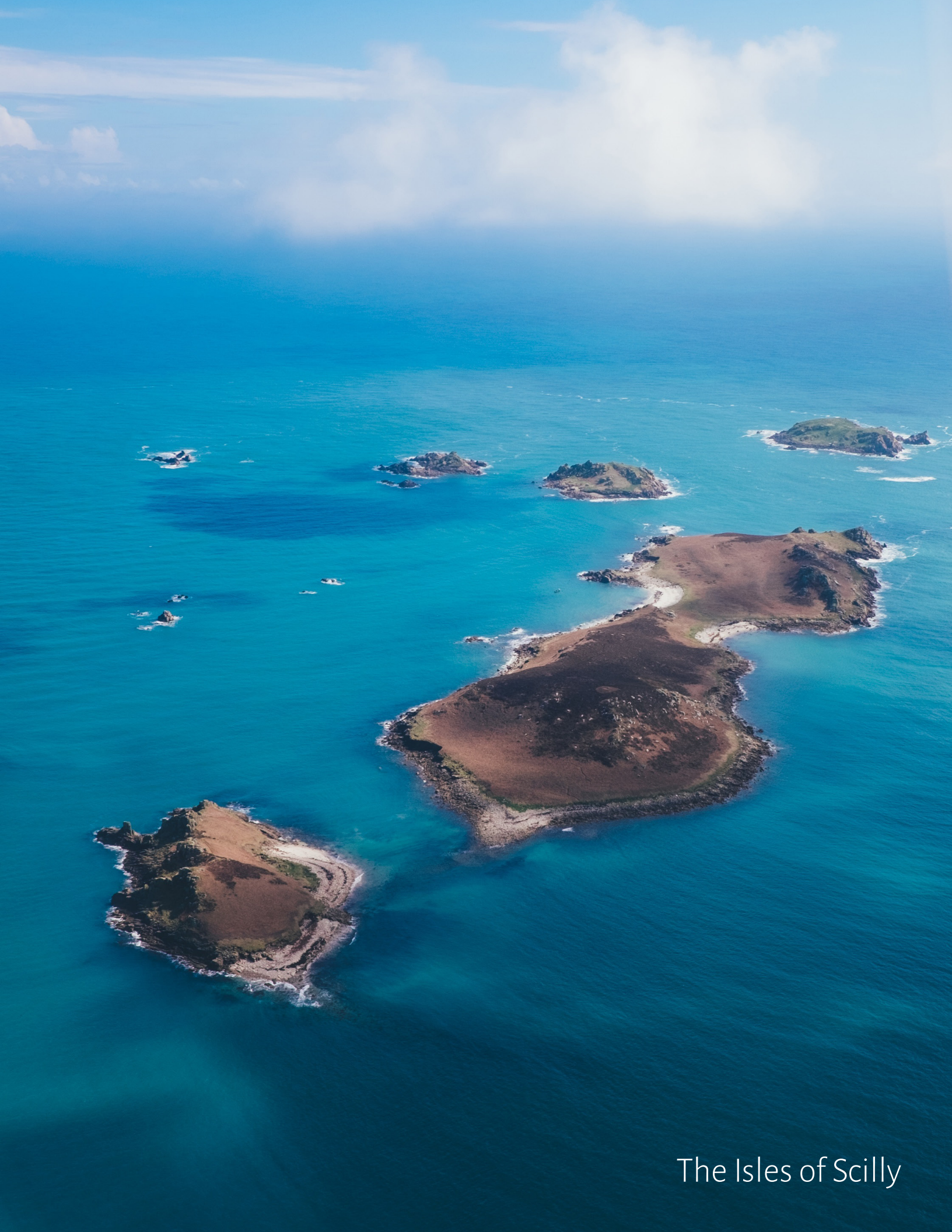
The Isles of Scilly