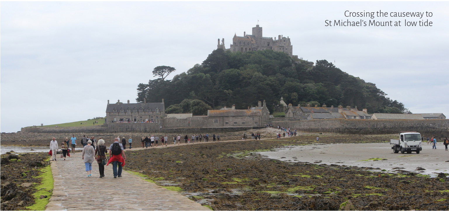
Crossing the causeway to St Michael's Mount at low tide

architecture, and picturesque setting, St Michael's Mount is a must-visit destination for anyone exploring the Cornish coast.