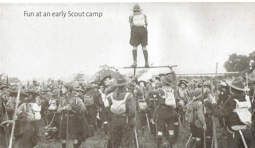
Fun at an early Scout camp