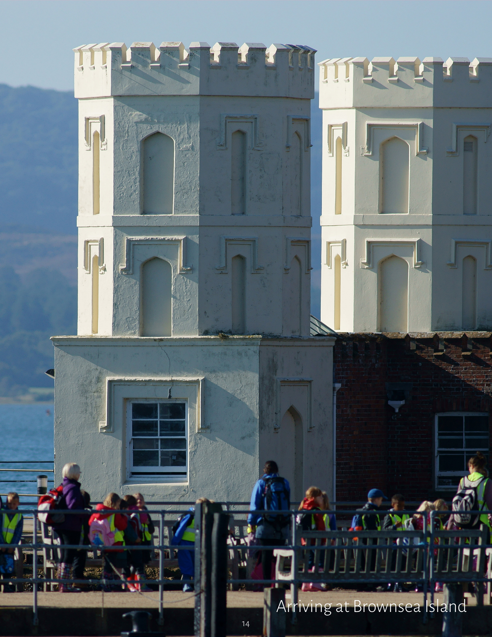
Arriving at Brownsea Island