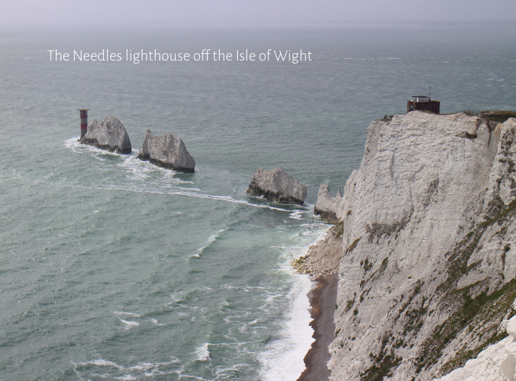
The Needles lighthouse off the Isle of Wight