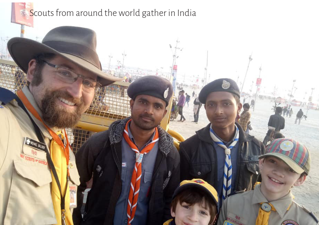
Scouts from around the world gather in India

Baden-Powell believed in the transformative power of the outdoors in shaping young minds and instilling a sense of responsibility towards the